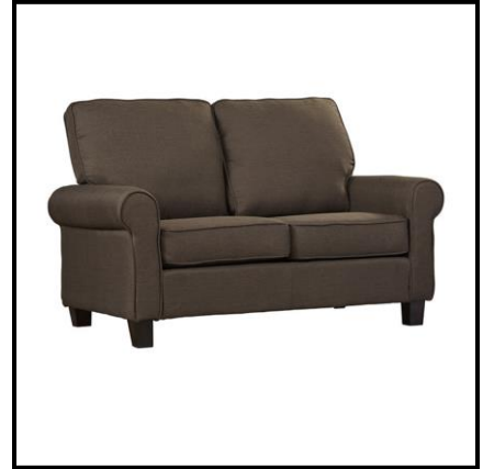
Light Brown Linen Weave Loveseat