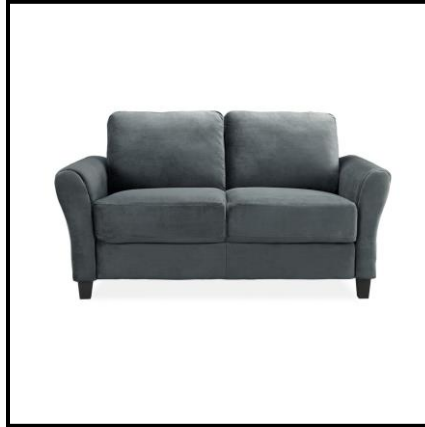
Gray Microfiber Loveseat