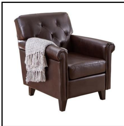
Tufted Leather Arm Chair

If we are supplying this piece of furniture for your room, please choose your style from our Arm Chair Collection below. This will be set up in your room prior to your move-in: