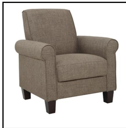
Classic Upholstered Arm Chair