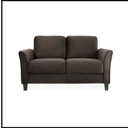
Brown Microfiber Loveseat

If we are supplying this piece of furniture for your room, please choose your style from our Loveseat Collection below. This will be set up in your room prior to your move-in: