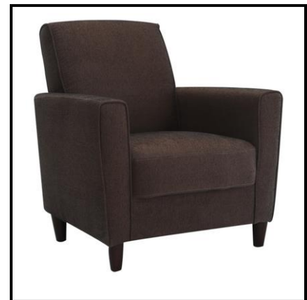
Gallery Fabric Arm Chair

Please Note: Final décor items & furniture may vary slightly from pictures in this guide based on available inventory at the time of rental. We do our best to match resident furniture orders as closely as possible.